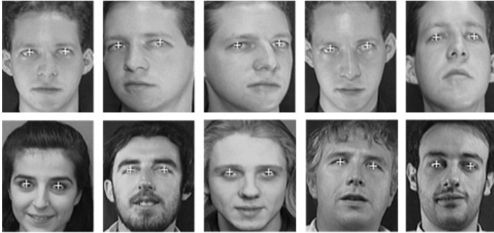
Fig. 3. Examples for faces without spectacles

The execution time of the proposed algorithm is about 0.982 second on average by a PC whose CPU is Pentium IV, 1.8 GHz. It's remarkable that this execution time is reckoned for a program written in Matlab. Obviously, the execution time would be reduced a lot if the program is transplanted from Matlab to C or C++.