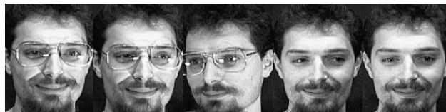
Fig. 1. Five images in ORL database.

We have done an experiment on the ORL database to evaluate performance of 2D-LDA, 2D-